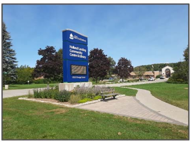
Holland Landing Community Centre & Library Signage, Planting and Bench