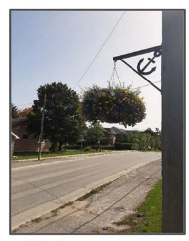
Streetscape Hanging Baskets with Anchor Themed Bracket