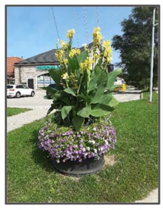
Yonge & Bradford Street Planting Barrels