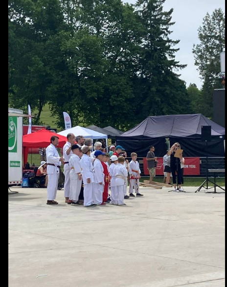
Community Martial Arts Karate Demonstration