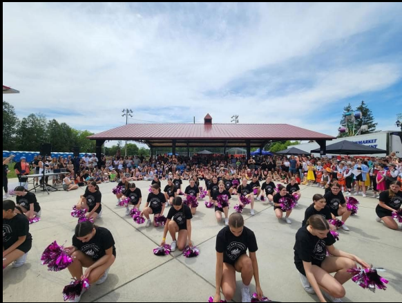
Kicks Dance Demonstration