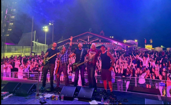
Live Music From Local Talent