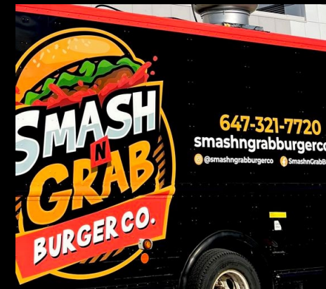
Local Food Trucks