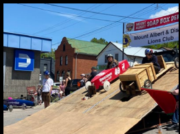
Soap Box Derby