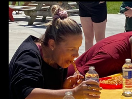
Spaghetti Eating Contest