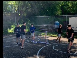
Ball Hockey Tournament