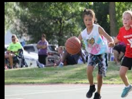
3v3 Basketball Tournament