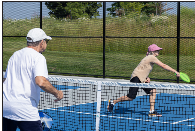
Ross Family Complex Pickleball Courts

The total approved budget of $73.5 million is comprised of $16.7 million for capital projects, $38.6 million for tax-supported programs, $12.8 million for water services, and $5.4 million for development fees.